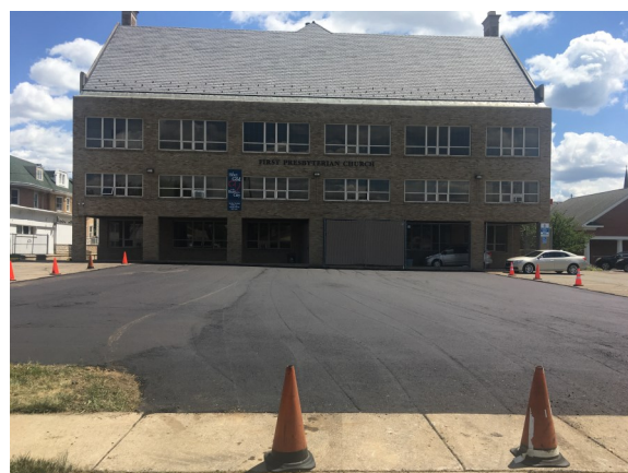
The (almost) finished product.