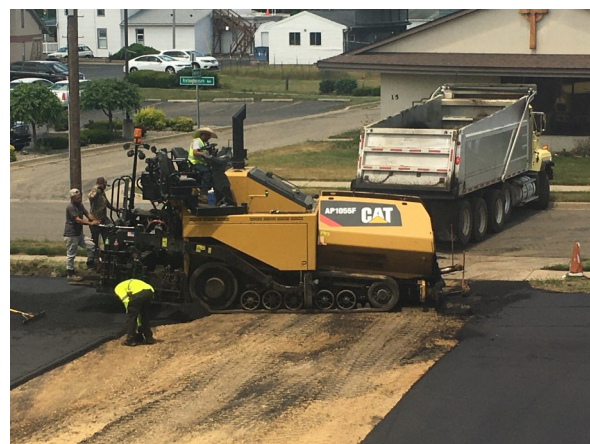
Parking lot project in progress.