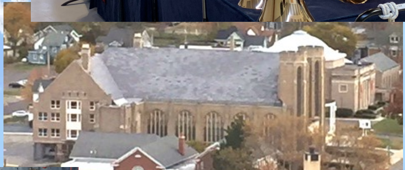
First Presbyterian Church of Battle Creek