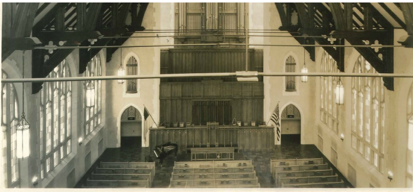
The chancel as pictured in 1928 (above) and post-2012 after the redesign that significantly improved its size, accessibility, flexibility and use.

The first tier was to refurbish the Fellowship Hall to make it an attractive, and comfortable venue for year round use and as needed for worship experiences. The second project was to renovate the Chancel to be consistent with our biblical and theological heritage, to significantly improve its usability, flexibility and safety as well as enhance our outreach and service to the community. The third was Sanctuary updates including lighting improvements, painting, refurbishment of pews, woodwork, and flooring.