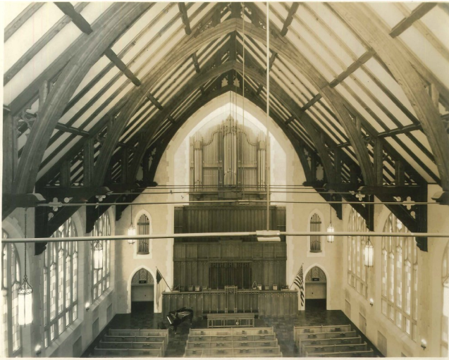
The sanctuary in 1928 upon the dedication of the build-