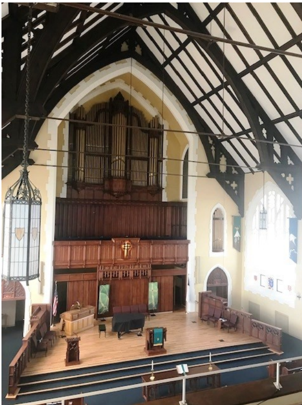
The sanctuary in November 2018 after refurbishing