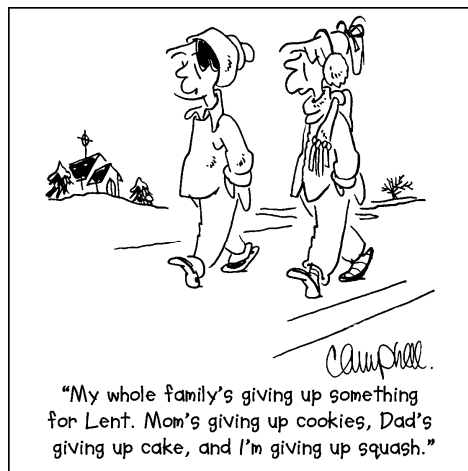
“My whole family’s giving up something for Lent. Mom’s giving up cookies, Dad’s giving up cake, and I’m giving up squash.”

Mark Your Calendar Now! VBS: Galactic Blast June 21-25, 2010 Westlake Presbyterian Church